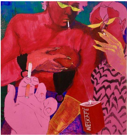
Noemi Conan , Tiger Milk , 2022 Acrylic on canvas, 81 x 81 cm

Send Nudes re-examines the tradition of the female nude, subverting established iconographies with a trashy attitude and a loud aesthetic.